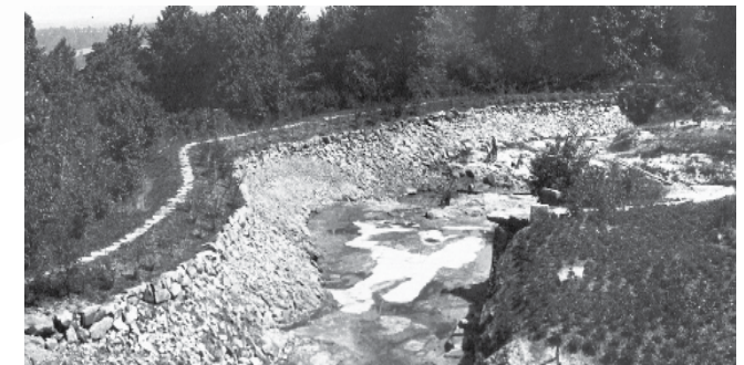
Construction of the Lagoon, c. 1914.

The stone taken from here was ground up to make glass. I filled the depressions with water, planted foliage and grass.