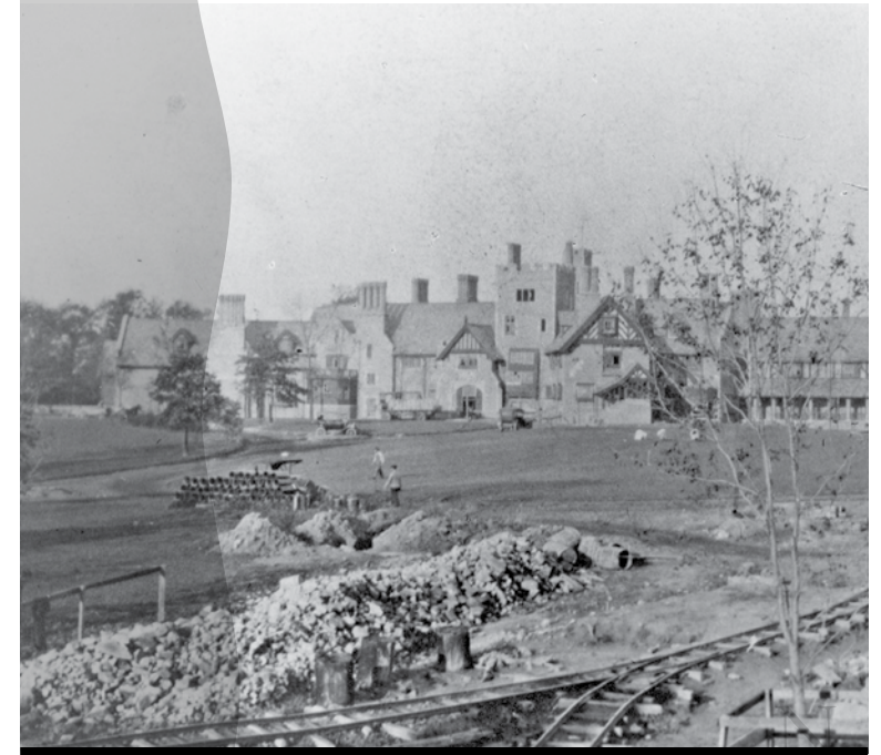
Construction of Stan Hywet, c. 1915.

SUMMIT COUNTY SECTION STAN HYWET HALL & GARDENS