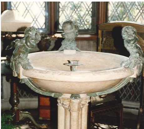
Fountain bowl and putti before restoration.

The marble fountain in the center of the room needed a large amount of work. Due to water and calcium deposits — as well as poor temperature and humidity control in a 100-year-old house — the fountain had discolored and cracked. To restore, the marble was honed by hand to remove deposits, and the cracks were filled with a matching epoxy. The marble bowl and bronze putti (cherubs) were polished to bring back their shine.