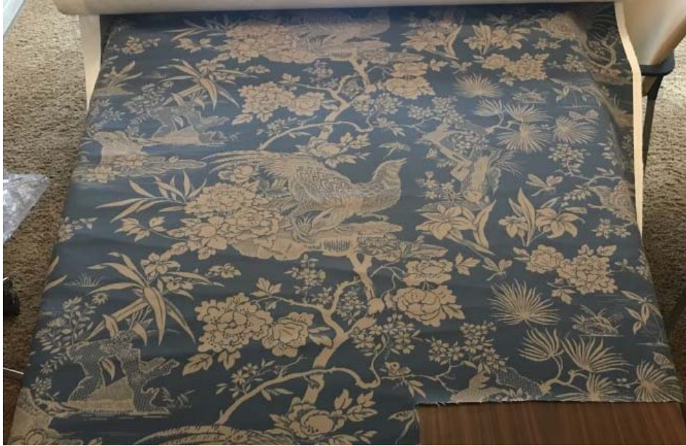
A full repeat of the new fabric.