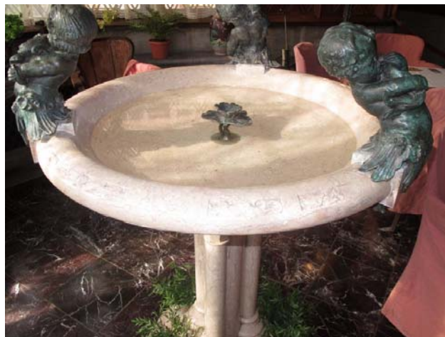
Fountain bowl and putti after restoration efforts.