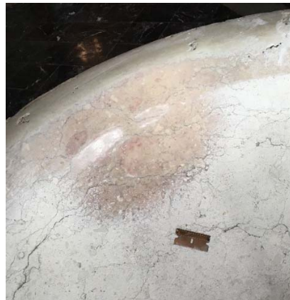
Testing a honing spot to remove deposits.