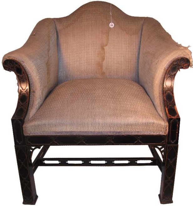
Second generation upholstery