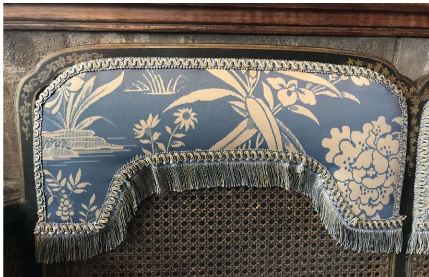
2018 upholstery and trim.