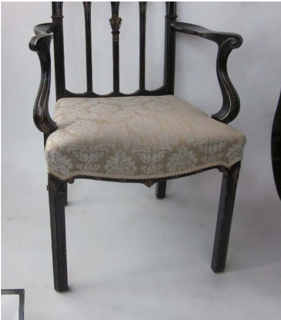
Second generation fabric and trim