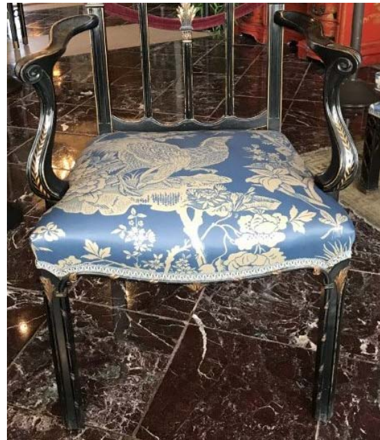
2018 fabric and trim