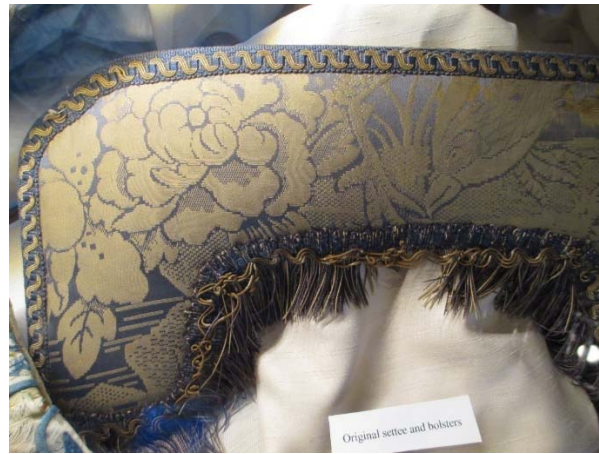
Original upholstery and fringe trim.

The collections team wanted to restore the furniture with fabric in the original blue and gold pattern, so the team went to the archives and found samples of the original fabric and trim to use as a guide to determine how the new custom fabric and trim should look.