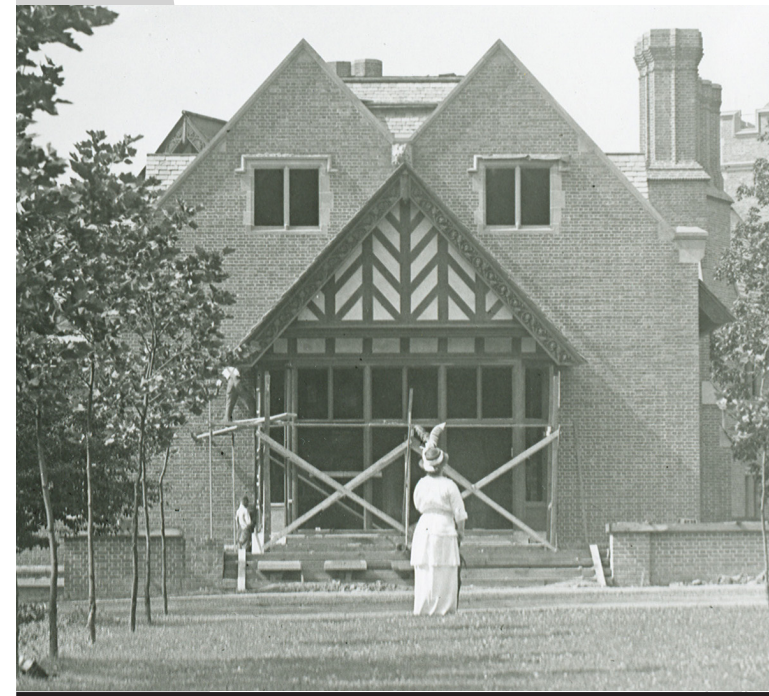
Gertrude Seiberling observes the Manor House construction, c.1915