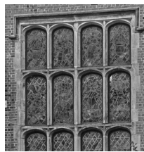
Stained glass window